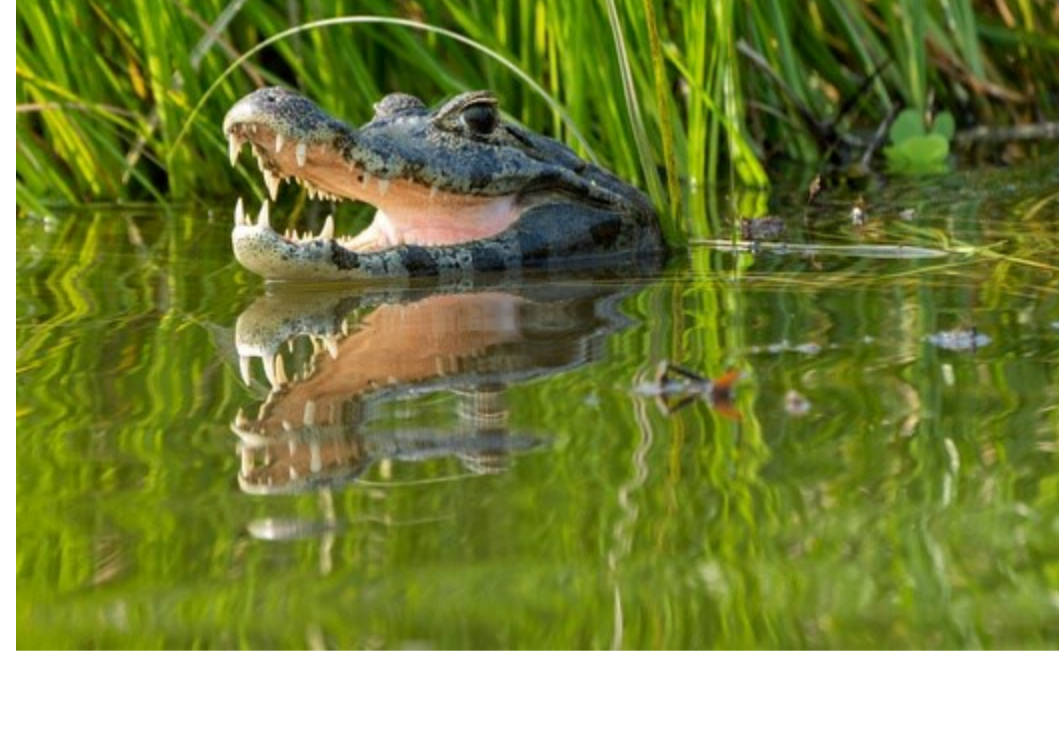
Alligator in the wild, Porto Jofre, Mato Grosso, Brazil